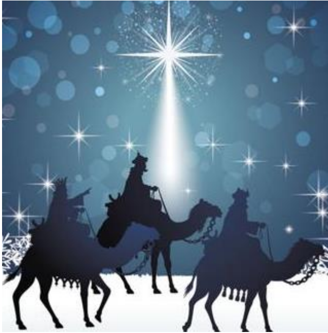
Traditional Picture of Epiphany