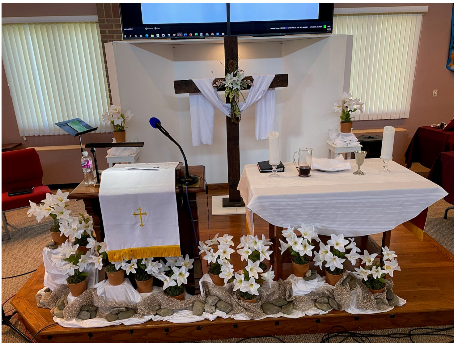
Our Easter Decorations, April 17th, Submitted by Beverly Cook